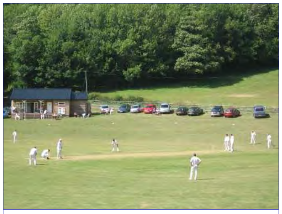
Bride Vale Cricket Club in action

The Magazine of The Bride Valley Churches